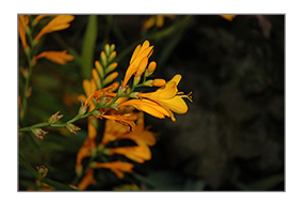
Columbus Crocosmia flowers