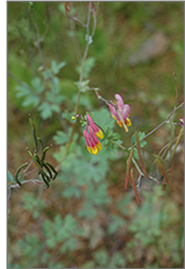
Pale Corydalis flowers