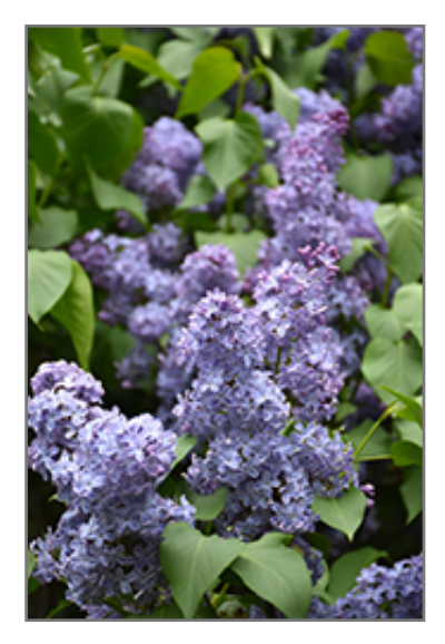
Wedgewood Blue Lilac flowers

A breathtaking spring blooming shrub featuring excruciatingly fragrant true blue flowers in upright panicles; upright, compact habit, very hardy, tends to sucker, ideal as a low screen; full sun and well-drained soil, allow room for air movement