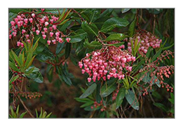
Mexican Summer Holly flowers

A little seen, but highly attractive large shrub or small tree, producing lily-of-the-valley like flower clusters in spring, followed by bright red berries in summer; a great water conservation choice, perfect for dry areas