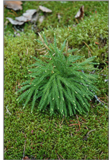
American Climacium Moss