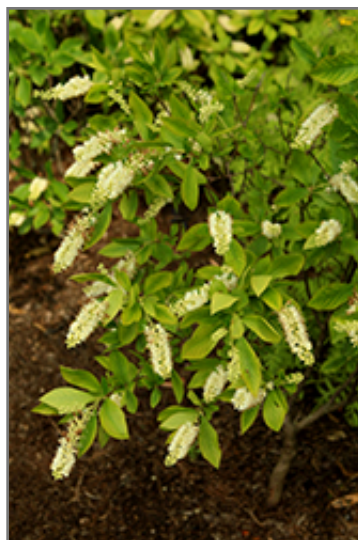
Sugartina Crystalina Summersweet flowers