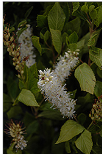
Sugartina Crystalina Summersweet flowers

Sugartina Crystalina Summersweet is recommended for the following landscape applications;