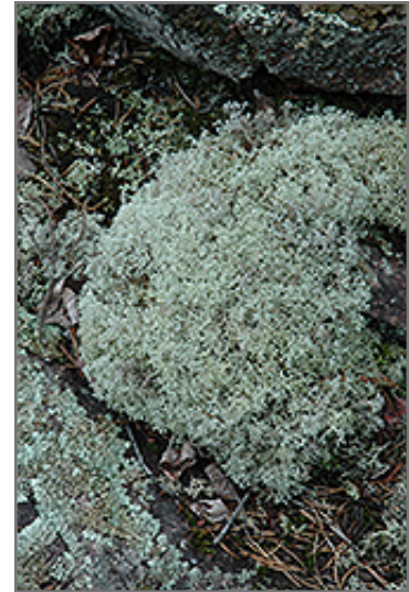
Reindeer Moss

Reindeer Moss will grow to be only 3 inches tall at maturity, with a spread of 12 inches. Its foliage tends to remain low and dense right to the ground. It grows at a slow rate, and under ideal conditions can be expected to live for approximately 30 years. As an herbaceous perennial, this plant will usually die back to the crown each winter, and will regrow from the base each spring. Be careful not to disturb the crown in late winter when it may not be readily seen!