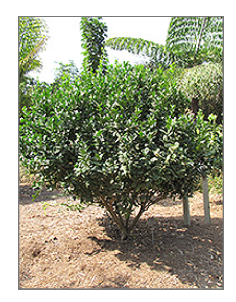
Bearss Seedless Lime

This is a multi-stemmed evergreen tree with an upright spreading habit of growth. Its average texture blends into the landscape, but can be balanced by one or two finer or coarser trees or shrubs for an effective composition. This is a relatively low maintenance plant, and is best pruned in late winter once the threat of extreme cold has passed. It is a good choice for attracting birds, bees and butterflies to your yard. It has no significant negative characteristics.