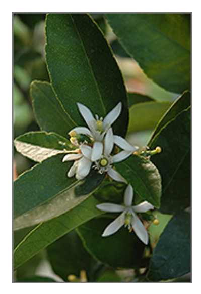
Bearss Seedless Lime flowers