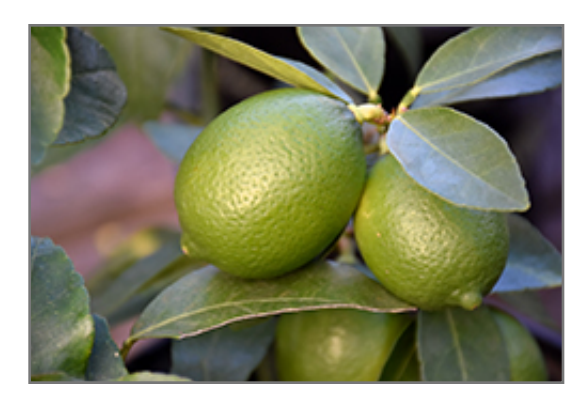
Bearss Seedless Lime fruit