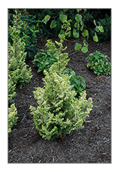
Lucas Hinoki Falsecypress