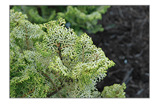
Lucas Hinoki Falsecypress foliage