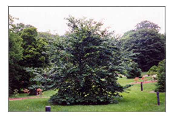
American Beech