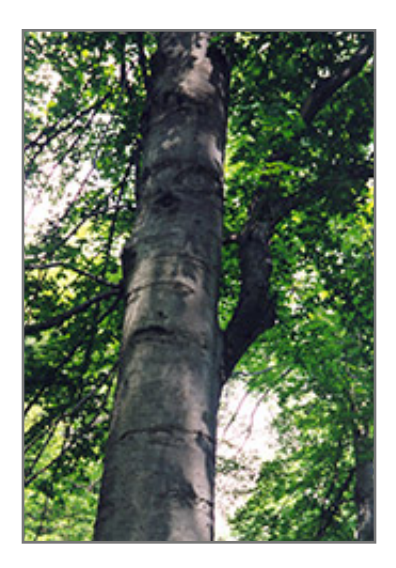
American Beech bark

This tree should only be grown in full sunlight. It requires an evenly moist well-drained soil for optimal growth, but will die in standing water. It is not particular as to soil pH, but grows best in rich soils. It is quite intolerant of urban pollution, therefore inner city or urban streetside plantings are best avoided, and will benefit from being planted in a relatively sheltered location. This species is native to parts of North America.