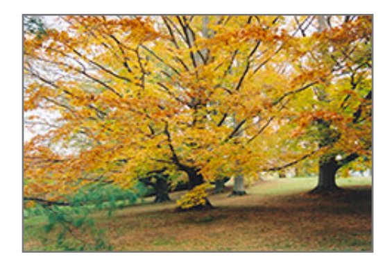
American Beech in fall