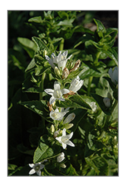
Bellefleur White Clustered Bellflower flowers