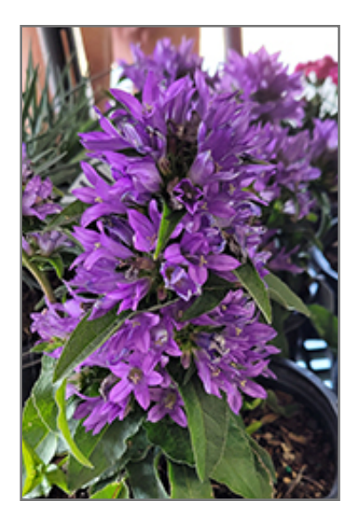
Bellefleur Blue Clustered Bellflower flowers