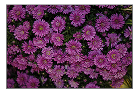
Pink Henry Aster flowers