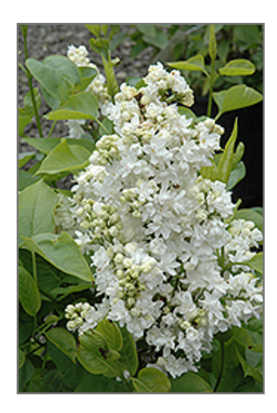
Mme. Lemoine Lilac flowers