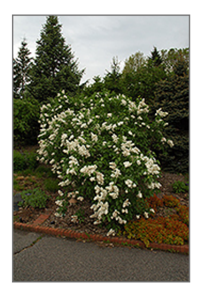
Mme. Lemoine Lilac in bloom