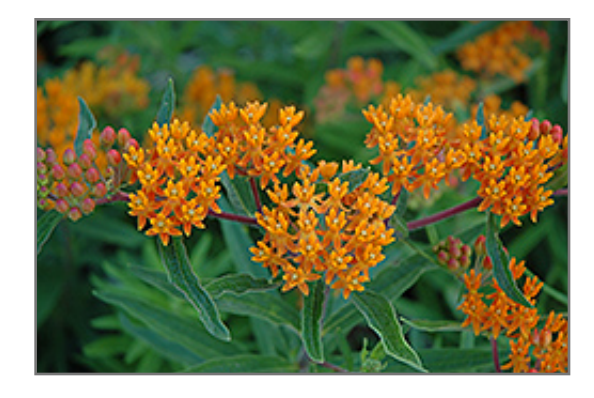
Gay Butterflies Butterfly Weed flowers