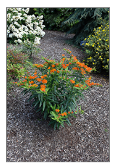
Gay Butterflies Butterfly Weed in bloom