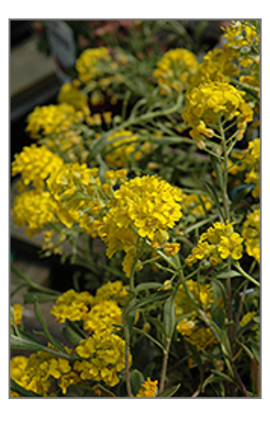
Alpine Alyssum flowers

This hardy variety is perfect for edging a sunny border or accenting a rock garden; yellow flower clusters appear above a mounded cushion of leaves in mid to late spring; evergreen in mild winter areas and drought tolerant once established