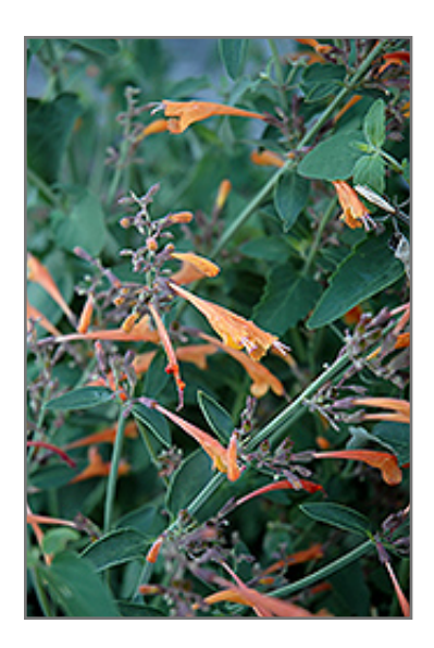
Coronado Hyssop flowers