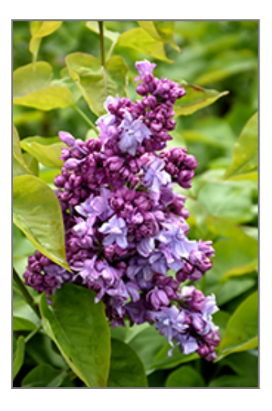
Katherine Havemeyer Lilac flowers

Katherine Havemeyer Lilac is a multi-stemmed deciduous shrub with an upright spreading habit of growth. Its relatively coarse texture can be used to stand it apart from other landscape plants with finer foliage.