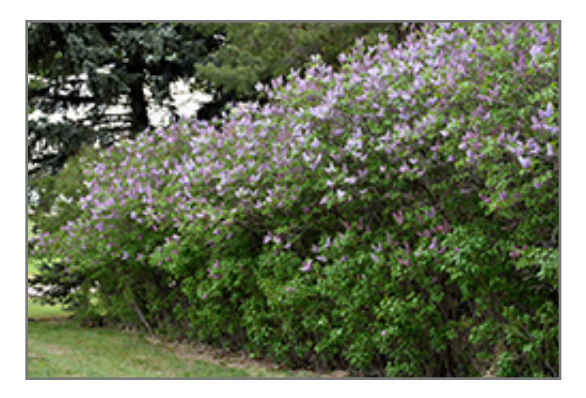
Katherine Havemeyer Lilac in bloom