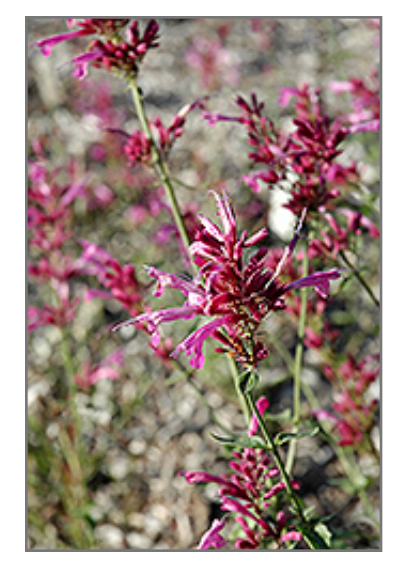
Heatwave Hyssop flowers

Easy-to-care for perennial flowers on airy spikes add lovely texture to any garden; incredible magenta-pink color; a favorite for native butterflies and hummingbirds; soothing, aromatic, licorice scented foliage for the fragrant garden