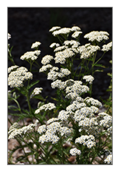
Common Yarrow flowers

Common Yarrow is recommended for the following landscape applications;