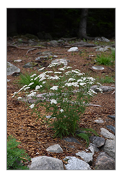
Common Yarrow in bloom