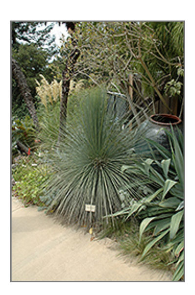
Grass Tree

Grass Tree will grow to be about 20 feet tall at maturity, with a spread of 8 feet. It has a low canopy with a typical clearance of 4 feet from the ground, and is suitable for planting under power lines. It grows at a slow rate, and under ideal conditions can be expected to live for 80 years or more.