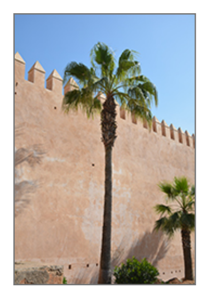
Desert Fan Palm

This tropical plant should only be grown in full sunlight. It is very adaptable to both dry and moist locations, and should do just fine under average home landscape conditions. It is considered to be drought-tolerant, and thus makes an ideal choice for xeriscaping or the moisture-conserving landscape. It is not particular as to soil type or pH. It is somewhat tolerant of urban pollution. This species is native to parts of North America.