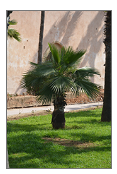
Desert Fan Palm

Desert Fan Palm is a fine choice for the yard, but it is also a good selection for planting in outdoor pots and containers. Because of its height, it is often used as a 'thriller' in the 'spiller-thriller-filler' container combination; plant it near the center of the pot, surrounded by smaller plants and those that spill over the edges. It is even sizeable enough that it can be grown alone in a suitable container. Note that when grown in a container, it may not perform exactly as indicated on the tag - this is to be expected. Also note that when growing plants in outdoor containers and baskets, they may require more frequent waterings than they would in the yard or garden. Be aware that in our climate, most plants cannot be expected to survive the winter if left in containers outdoors, and this plant is no exception. Contact our experts for more information on how to protect it over the winter months.