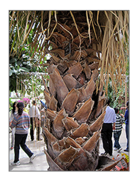
Desert Fan Palm bark