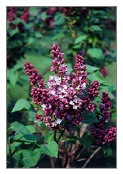
Belle de Nancy Lilac flowers

A stunning spring blooming lilac featuring intensely fragrant double pink flowers in upright panicles; upright, multi-stemmed habit, very hardy, tends to sucker, ideal for screening; full sun and well-drained soil, allow room for air movement