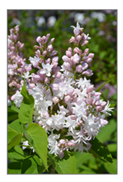
Beauty of Moscow Lilac flowers

This is a high maintenance shrub that will require regular care and upkeep, and should only be pruned after flowering to avoid removing any of the current season's flowers. It is a good choice for attracting butterflies to your yard, but is not particularly attractive to deer who tend to leave it alone in favor of tastier treats. Gardeners should be aware of the following characteristic(s) that may warrant special consideration;