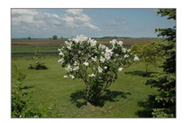
Beauty of Moscow Lilac in bloom