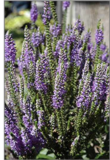
Blue Explosion Speedwell flowers