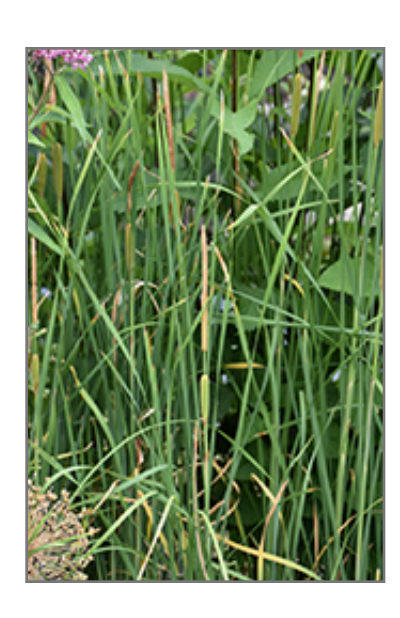
Miniature Cattail foliage

Miniature Cattail has masses of beautiful spikes of brown catkins rising above the foliage from early to mid summer, which are most effective when planted in groupings. Its grassy leaves are dark green in colour. The foliage often turns yellow in fall.