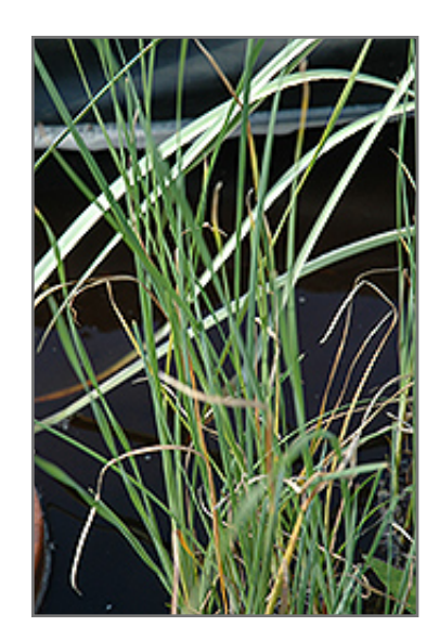
Cattail foliage

Cattail is ideally suited for growing in a pond, water garden or patio water container, and is recommended for the following landscape applications;