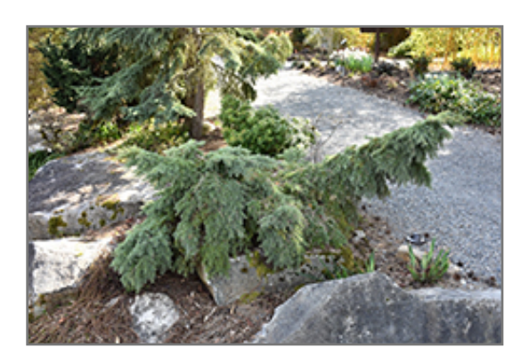
Elizabeth Mountain Hemlock

This shrub will require occasional maintenance and upkeep, and is best pruned in late winter once the threat of extreme cold has passed. Gardeners should be aware of the following characteristic(s) that may warrant special consideration;