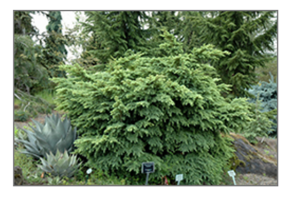
Elizabeth Mountain Hemlock

Elizabeth Mountain Hemlock is a multi-stemmed evergreen shrub with an upright spreading habit of growth. It lends an extremely fine and delicate texture to the landscape composition which should be used to full effect.