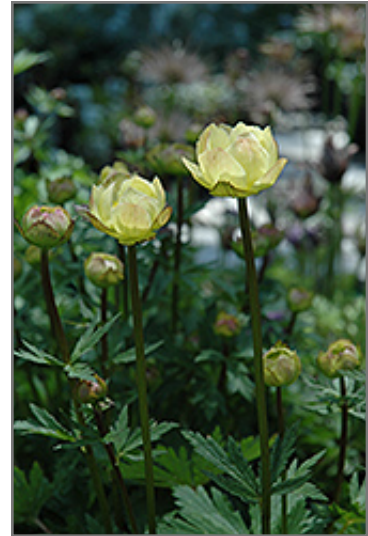
Alabaster Globeflower flowers