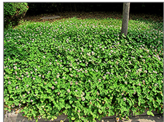
White Clover