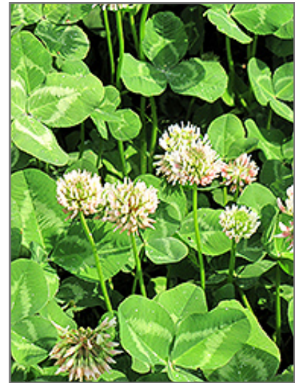
White Clover flowers

This is a high maintenance plant that will require regular care and upkeep, and is best cleaned up in early spring before it resumes active growth for the season. It is a good choice for attracting bees and butterflies to your yard. Gardeners should be aware of the following characteristic(s) that may warrant special consideration;