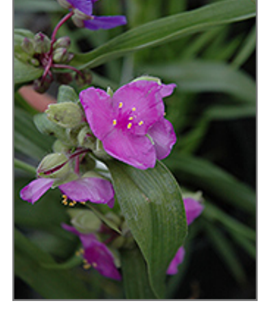
Valour Spiderwort flowers

This selection is an excellent plant for borders, rock gardens, and massed as groundcover; a prolific bloomer with beautiful hot pink to purple-blue flowers accented with bright yellow stamens; dense mounded foliage is mid-green and attractive