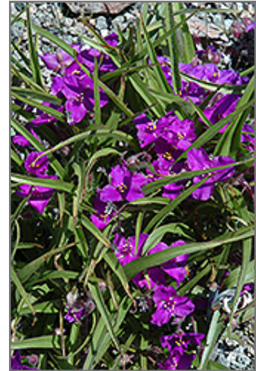
Wild Crocus flowers