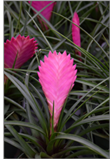
Pink Quill flowers

This plant does best in full sun to partial shade. It prefers to grow in average to dry locations, and dislikes excessive moisture. It is considered to be drought-tolerant, and thus makes an ideal choice for a low-water garden or xeriscape application. It is not particular as to soil pH, but grows best in poor soils. It is somewhat tolerant of urban pollution. This species is not originally from North America. It can be propagated by division.