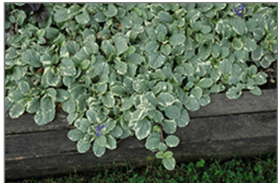
Silver Queen Bugleweed