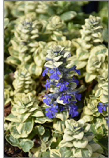
Silver Queen Bugleweed flowers

Silver Queen Bugleweed is a dense herbaceous evergreen perennial with a ground-hugging habit of growth. Its medium texture blends into the garden, but can always be balanced by a couple of finer or coarser plants for an effective composition.