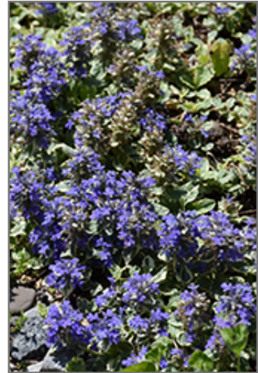
Silver Queen Bugleweed flowers