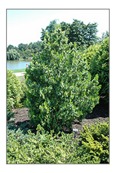
Elegantissima Arborvitae