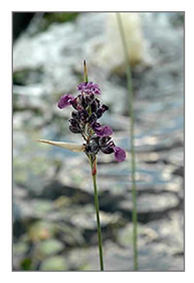
Powdery Thalia flowers

This plant will require occasional maintenance and upkeep, and should be cut back in late fall in preparation for winter. It is a good choice for attracting bees and butterflies to your yard. It has no significant negative characteristics.