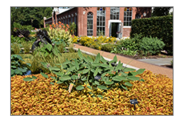
Powdery Thalia in bloom

Powdery Thalia is ideally suited for growing in a pond, water garden or patio water container, and is recommended for the following landscape applications;