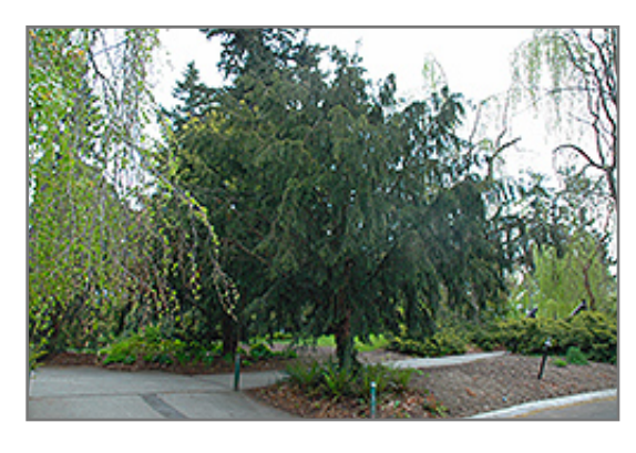
Dovaston Yew