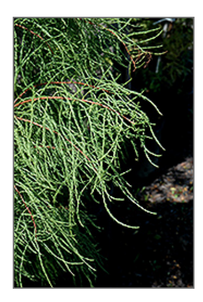
Debonair Baldcypress foliage