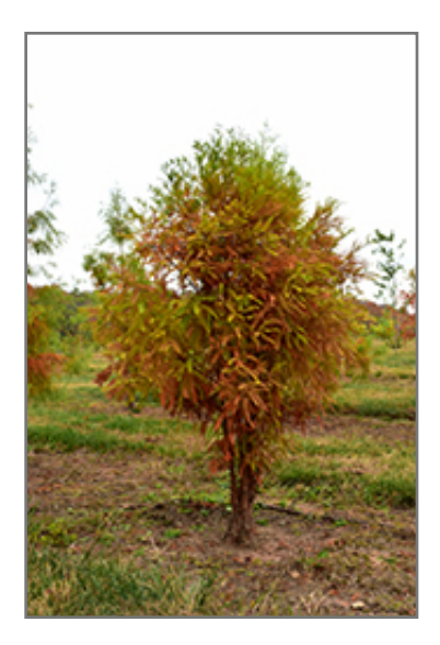
Debonair Baldcypress in fall