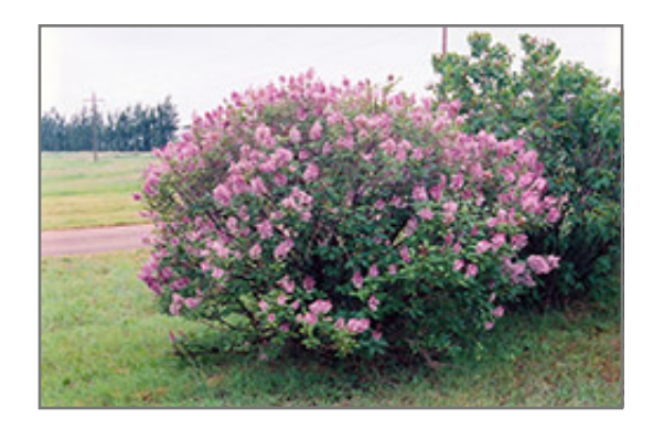
Miss Canada Lilac in bloom

Miss Canada Lilac is recommended for the following landscape applications;