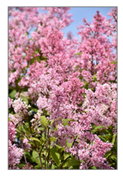
Miss Canada Lilac flowers

This is a relatively low maintenance shrub, and should only be pruned after flowering to avoid removing any of the current season's flowers. It is a good choice for attracting butterflies to your yard. It has no significant negative characteristics.