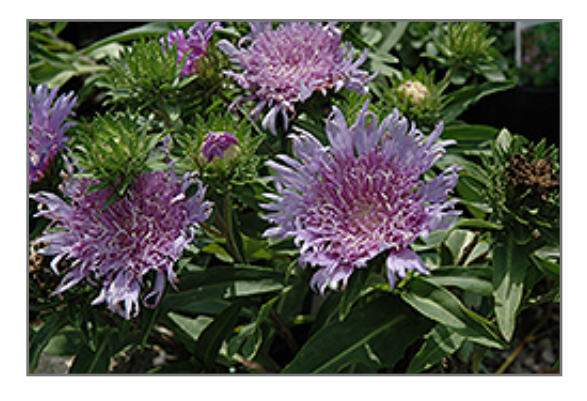
Klaus Jelitto Aster flowers