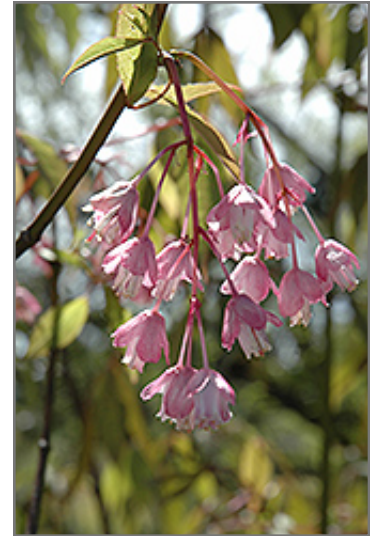
Rosea Chinese Bladdernut flowers