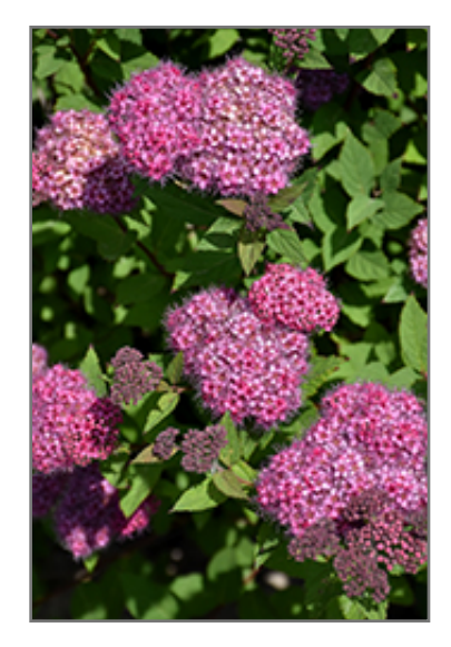
Double Play Artisan Spirea flowers

This shrub will require occasional maintenance and upkeep, and is best pruned in late winter once the threat of extreme cold has passed. It is a good choice for attracting butterflies to your yard, but is not particularly attractive to deer who tend to leave it alone in favor of tastier treats. It has no significant negative characteristics.