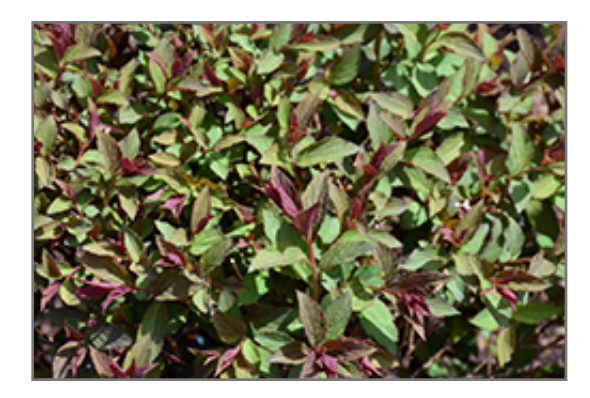
Double Play Artisan Spirea foliage