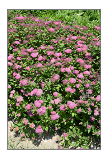
Double Play Artisan Spirea in bloom

This shrub should only be grown in full sunlight. It prefers to grow in average to moist conditions, and shouldn't be allowed to dry out. It is not particular as to soil type or pH. It is highly tolerant of urban pollution and will even thrive in inner city environments. This is a selected variety of a species not originally from North America.