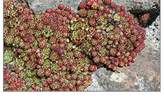
Hens And Chicks