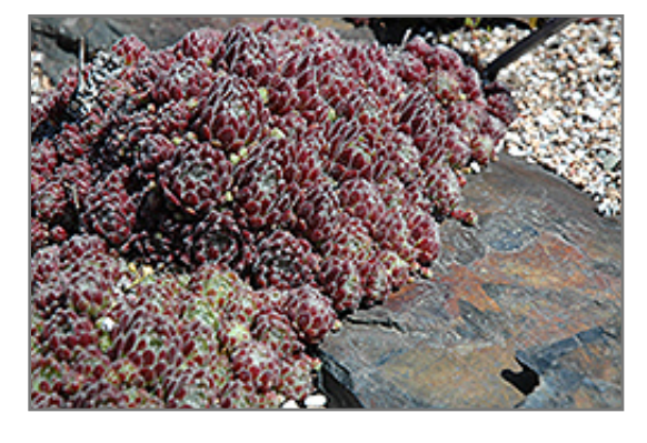
Ritton Hens And Chicks

Ritton Hens And Chicks is recommended for the following landscape applications;