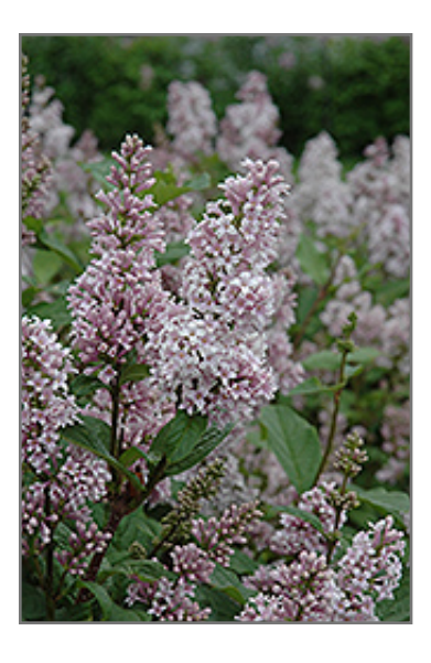
Coral Lilac flowers