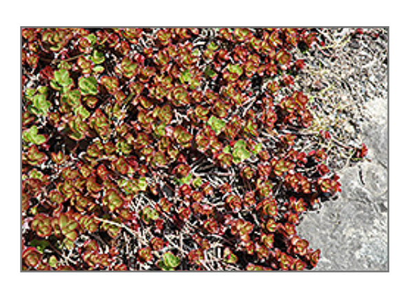
Two Row Stonecrop

This spreading variety is excellent for edging or rock gardens, or hot dry sites; produces a carpet of purple-red scalloped evergreen leaves; striking magenta flowers in fall; quite elegant spilling over a garden wall