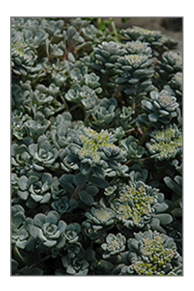
Broadleaf Stonecrop