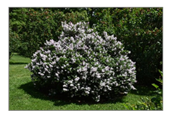
Miss Kim Lilac in bloom

Miss Kim Lilac is recommended for the following landscape applications;