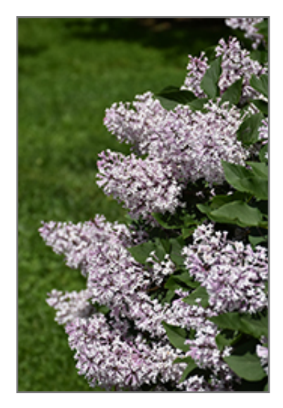
Miss Kim Lilac flowers

This is a relatively low maintenance shrub, and should only be pruned after flowering to avoid removing any of the current season's flowers. It is a good choice for attracting butterflies to your yard. It has no significant negative characteristics.