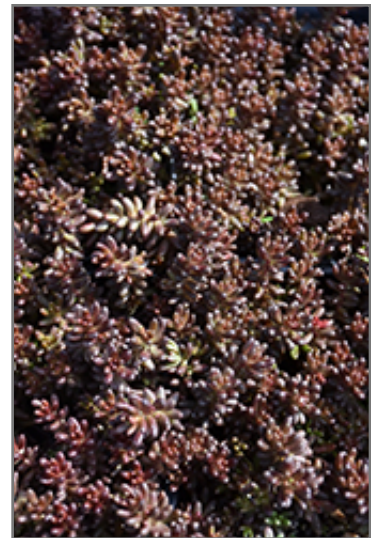
Murale Stonecrop foliage