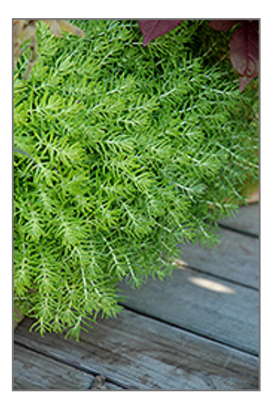
Lemon Ball Stonecrop foliage

This plant will require occasional maintenance and upkeep, and is best cleaned up in early spring before it resumes active growth for the season. Deer don't particularly care for this plant and will usually leave it alone in favor of tastier treats. Gardeners should be aware of the following characteristic(s) that may warrant special consideration;