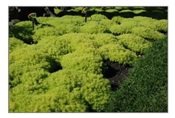
Lemon Ball Stonecrop