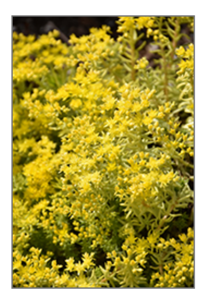
Lemon Ball Stonecrop flowers

Lemon Ball Stonecrop will grow to be about 8 inches tall at maturity, with a spread of 12 inches. When grown in masses or used as a bedding plant, individual plants should be spaced approximately 10 inches apart. Its foliage tends to remain low and dense right to the ground. It grows at a fast rate, and under ideal conditions can be expected to live for approximately 10 years. As an herbaceous perennial, this plant will usually die back to the crown each winter, and will regrow from the base each spring. Be careful not to disturb the crown in late winter when it may not be readily seen!